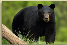
Living with Wildlife