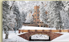
Upcoming Local Events