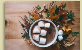
Holiday Greetings from the GVRHOA