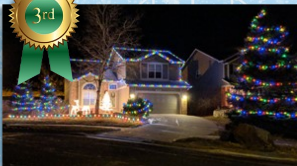
2040 Butternut Trail—Jay & Sharon Mullenix