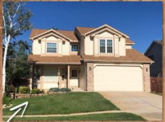
August – 5730 Dalton Dr