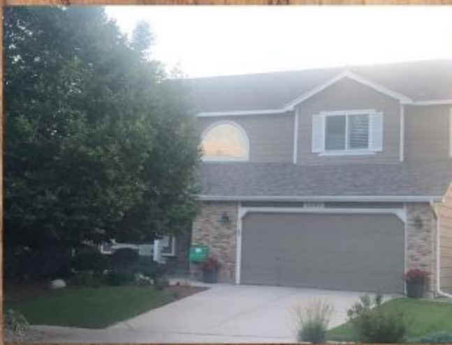
July – 5680 Astoria Way

Special thanks to our Assistant Yard of the Month Reviewers!