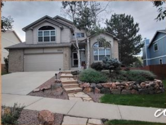
September – 5715 Flag Way