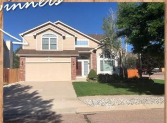
August – 5720 Dalton Dr